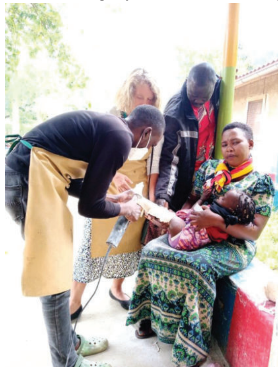
Clubfoot cast removal