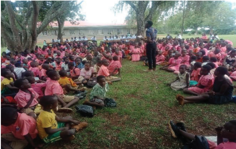
Sensitization at Namutamba Demonstration School