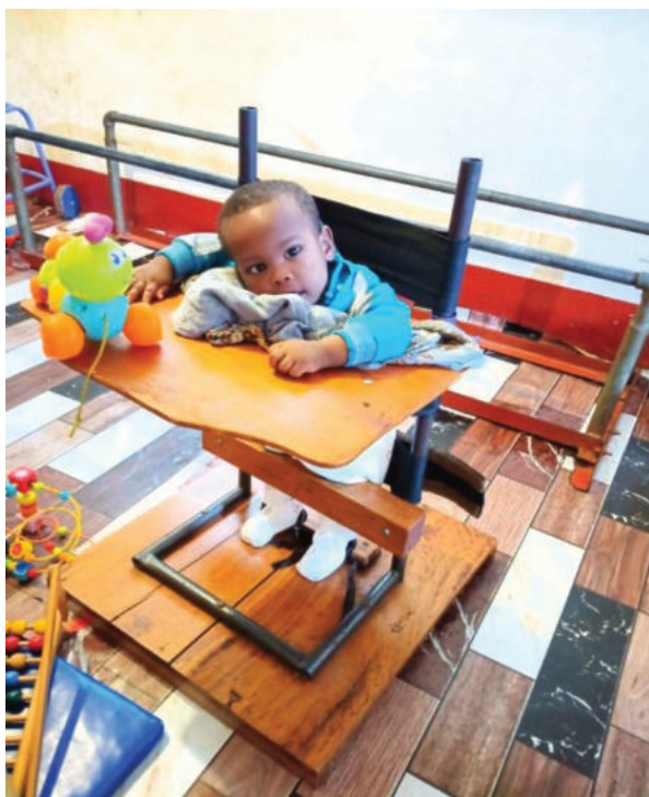
Postural Management of a Cerebral Palsy Child